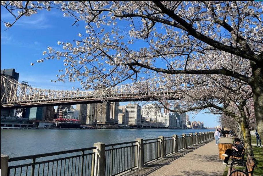
Roosevelt Island West Promenade