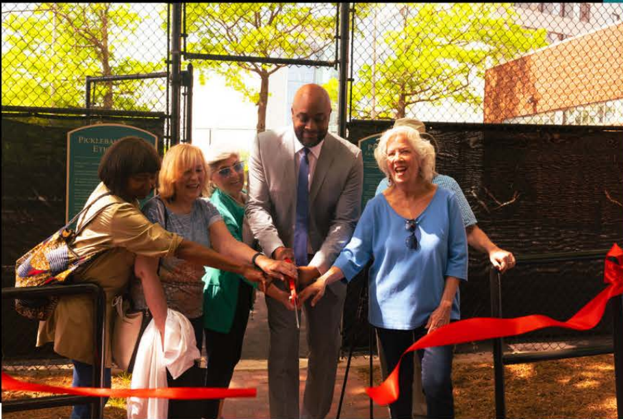
Ribbon Cutting for New pickleball Courts