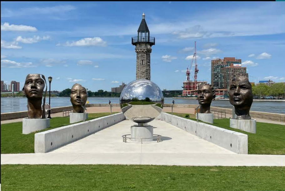
The Girl Puzzle Monument and Roosevelt Island Lighthouse