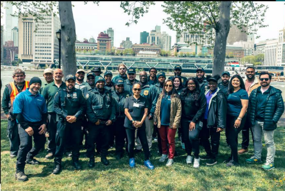
RIOC Staff During Annual EarthLove Day Event